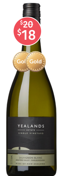
2017 YEALANDS SINGLE VINEYARD SAUVIGNON BLANC, AWATERE VALLEY