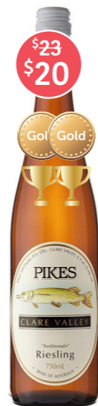
2016 PIKES TRADITIONALE RIESLING, CLARE VALLEY