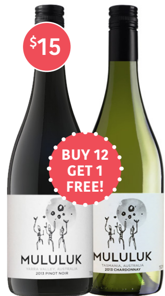
MULULUK PINOT NOIR, YARRA VALLEY OR CHARDONNAY, TASMANIA BUY 12 GET 1 FREE!