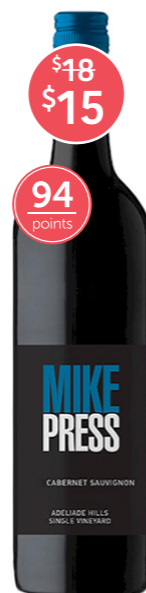
2015 MIKE PRESS CABERNET SAUVIGNON, ADELAIDE HILLS