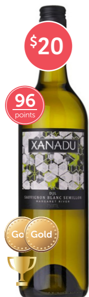
2017 XANADU DJL SAUVIGNON BLANC SEMILLON, MARG. RIVER