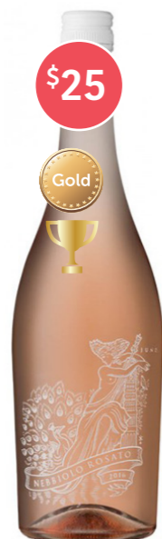
2018 LONGVIEW NEBBIOLO ROSATO, ADELAIDE HILLS