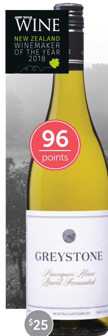
2017 BARREL FERMENATED SAUVIGNON BLANC Fabulous nose with a complex mix of barrel ferment spices, honeysuckle and fresh citrus and white fleshed stone fruit aromas. Equally enticing on the palate with vibrant fruit and barrel led flavours, satin texture, plenty of acidity and long finish. A great example of where NZ SB is heading.