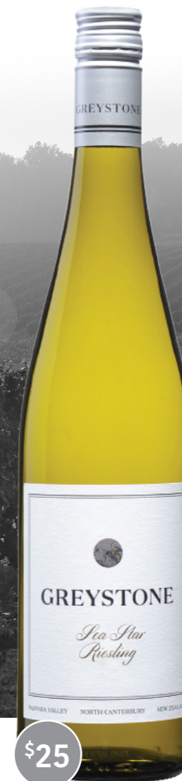
2016 SEA STAR RIESLING Clear and light gold in colour. A nose of aromatic herbs, lavender, rosemary and thyme. Palate is hefty, soft and creamy textured with salivating acidity and lingering lemon sherbet length. Ripe peach and citrus fruits add layers of complexity. A wine to savour now or age to 2024.