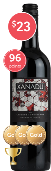
2014 XANADU DJL CABERNET SAUVIGNON, MARGARET RIVER