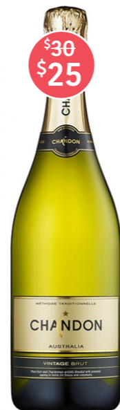
2012 CHANDON VINTAGE