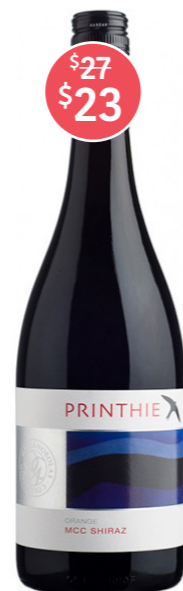
2012 PRINTHIE MCC SHIRAZ, ORANGE